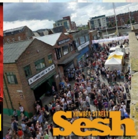
Humber Street Sesh

We have Freedom Festival and Humber Street Sesh which are two music and arts festivals in Hull that attract hundreds of thousands of people every year. We have one of the longest extension bridges in the world, and the world's only underwater aquarium. Hull was traditionally a fishing town on the east of England, near to the river Humber and the North Sea. A lot of the history of Hull is based on this fact. In the past we would have trawlermen (fishermen in big boats) who risked their lives for their work. As our own late famous poet Philip Larkin said: "Hull is on the edge of things" - we seem to be also, on the edge of the world.