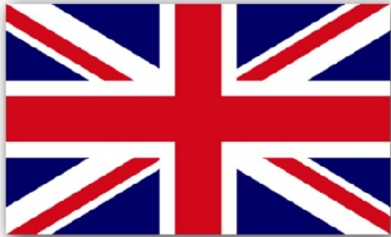
The Union Jack The flag of the United Kingdom

Although I was born in Hull which is in England, my mother was born in Scotland. Because of this, when I speak to people of where I am I generally use either the UK (United Kingdom) or Britain (Great Britain).