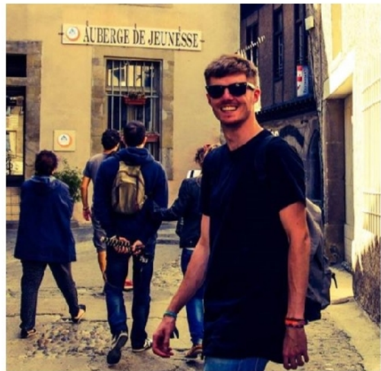
This is me.

I made a few friends in Prague who eventually recommended that I take a look at this opportunity with OKO. I have always wanted to take part in an EVS scheme, I always thought it would be another great experience for me. So far it is looking like it, and I am very excited for the next 8 months in Rychnov.