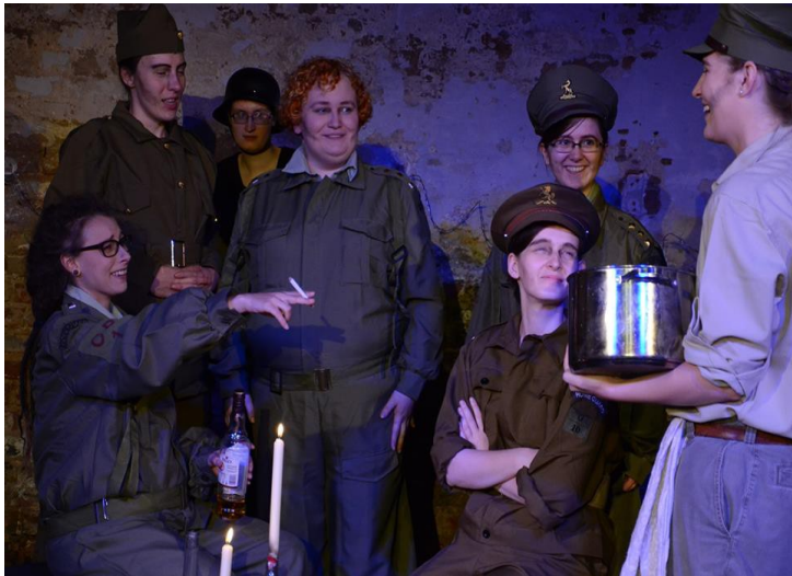
My theatre group during a play in 2014

From primary school on I have always played theatre and liked to watch it. For me it's amazing to play someone else and try to show why they act the way they act. And to be honest: It's fun to entertain people and give them a good time.