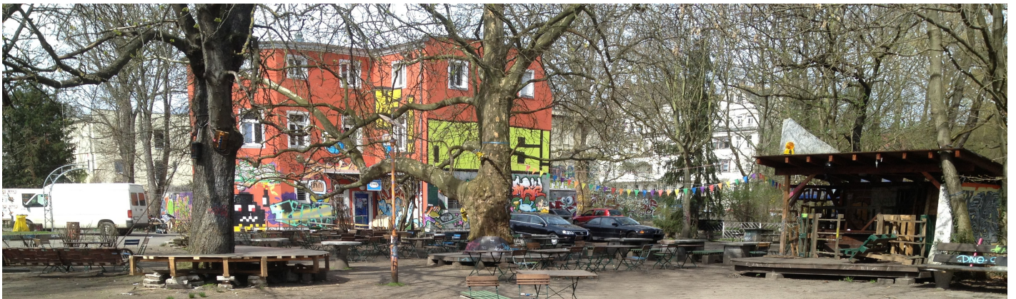
The Conne Island!

I'm interested in changing our life to the better through the means of politics and direct action. The Conne Island in Leipzig is a place where I learned a lot about this. They have great bands playing there, too!