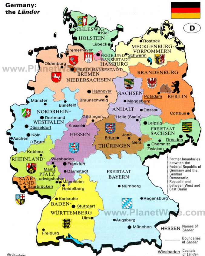
Germany and the Bundesländer

Germany is a federation consisting of 16 „Bundesländer“ . Each of them has their own history, their own education system, their own money policies and is more or less allowed to follow their own foreign policies.