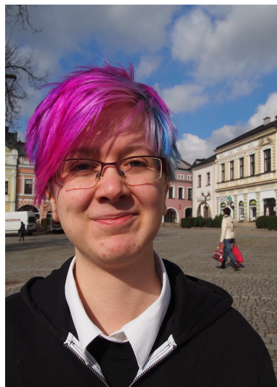
Me in Rychnov

Last year in autumn I dropped out of school. Since then I've been looking for a new project. My sending organisation forwarded me a mail from OKO, in which they were looking for a new volunteer . So I applied and got accepted very fast. I'm a great fan of languages . In the past I have tried to learn multiple languages, but I have to say that the only ones I speak on a decent level so far are German and English . I like both languages a lot and am very glad about the opportunity to use both of them. Hopefully I will also be able to speak some Czech after the EVS.