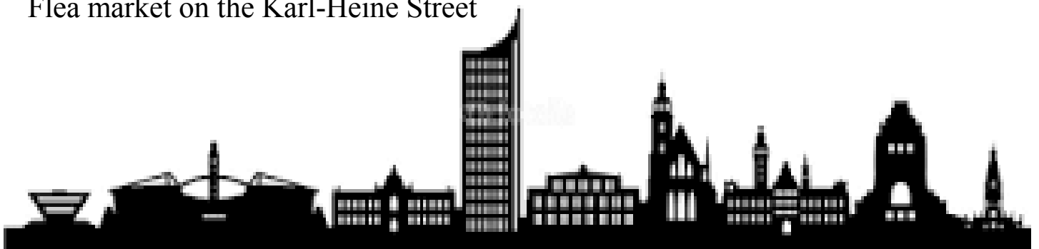
The „skyline“ with the most important buildings

Flea markets are very popular. Every weekend there is at least one somewhere in the city, but usually there are more. In summer they turn into street festivals with art, music and food.