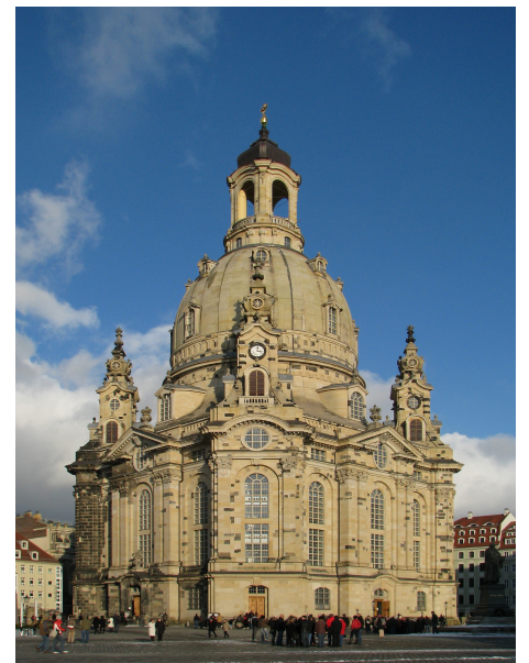
„Frauenkirche“ in Dresden