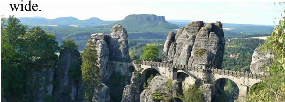
The „Bastei“ in so called „Saxonian Switzerland“

Before the first unification, it was a kingdom. The kings built many impressive castles and churches, especially in the capital Dresden. They also established the first production of porcellain in Europe . The „Meißner Porzellan“ is still famous and sold world wide.