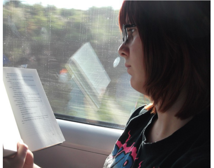
Reading on the train to Britain

I also like to travel and see other countries, because it's great to see new places and learn new things.