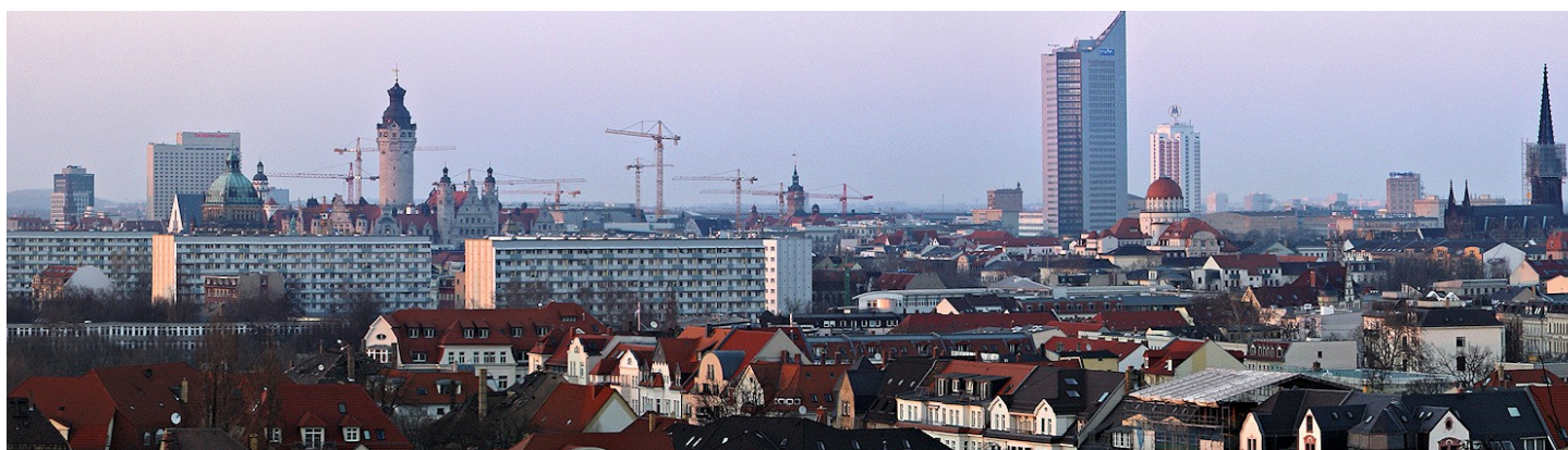
My hometown Leipzig!