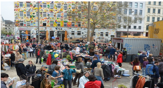
Flea market on the Karl-Heine Street

Flea markets are very popular. Every weekend there is at least one somewhere in the city, but usually there are more. In summer they turn into street festivals with art, music and food.