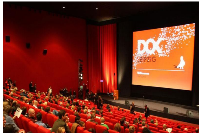
The documentary film festival

The city has a vivid underground and conventional cultural life . There are multiple cinemas, galleries, theatres, a center for classical music and an opera. Composers like Mendelssohn Bartholdy, Schumann and Bach lived and worked in Leipzig. It's still possible to listen to Bach's music in the church he composed for.