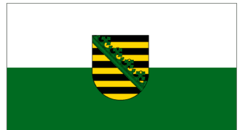
The flag of Saxony