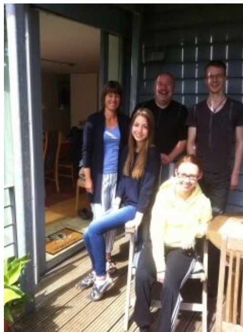
Me and my family

My dog Buffy is half Newfoundlander and half Hovaward. We got her when she was a small puppy, just a few weeks old, and now she will turn five this year and has become quite big! I love to teach her tricks and we often go for long walks together with one of my friends and her dog. Like most Newfoundlanders, she loves to swim or just splash around in the water.