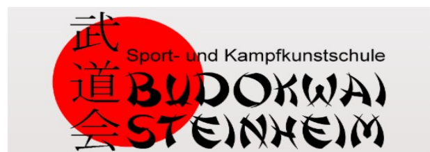
The logo of my dojo