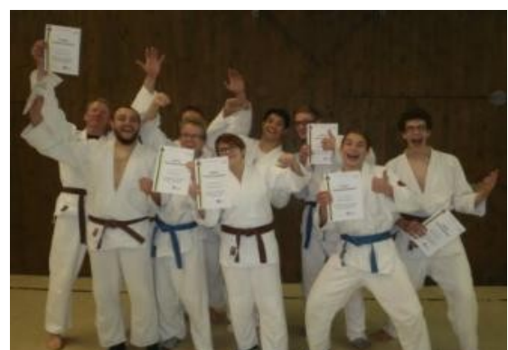
Some people that I train with