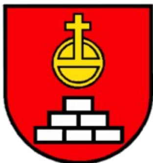
Emblem of Steinheim

My hometown is called Steinheim which literally translates into “Stonehome”.