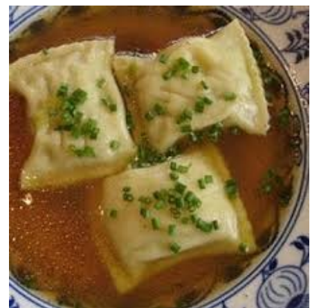
"Maultaschen", a traditional Swabian dish