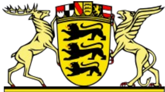
The emblem of Baden-Württemberg

In German, Lake Constance is called “Bodensee” and most people probably wouldn't know what you are talking about, if you used the English name. “Lake Constance” comes from the city “Konstanz”, the biggest city at Lake Constance.