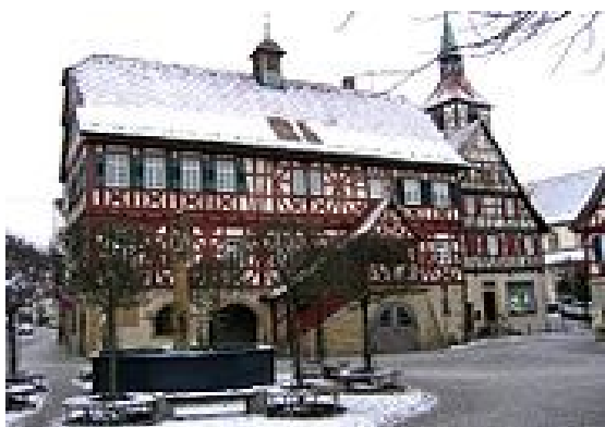
Town Hall of Steinheim

Later, they even found the skeleton of a Mammoth.