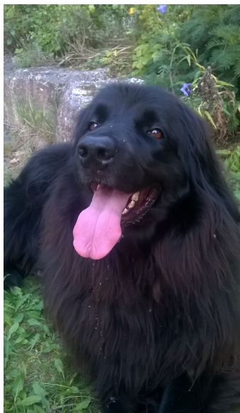
Buffy, the cutest dog in the world!