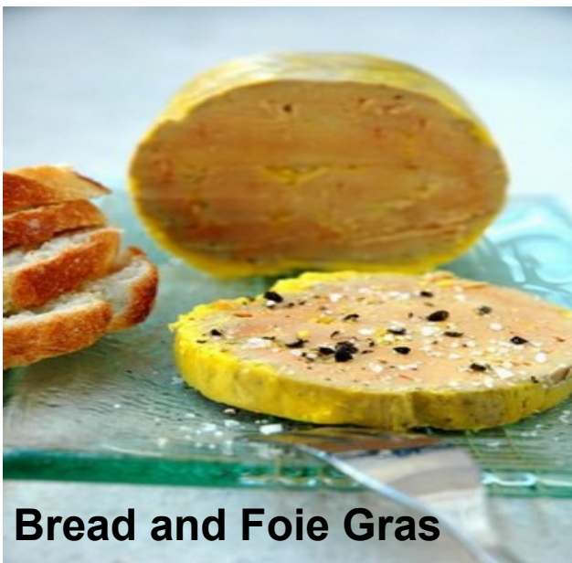
Bread and Foie Gras