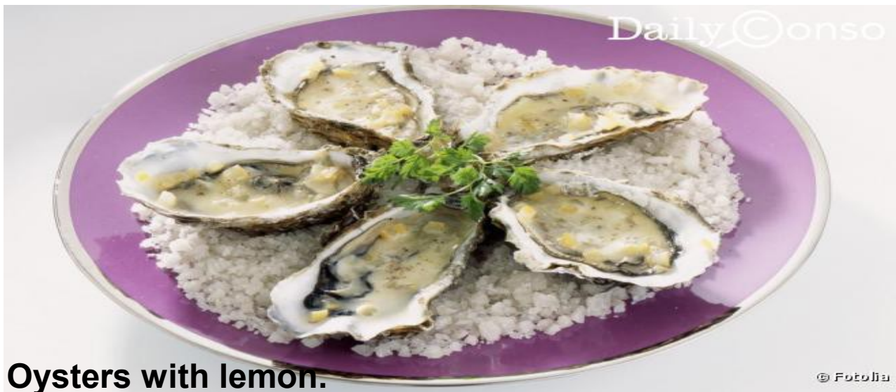
Oysters with lemon.