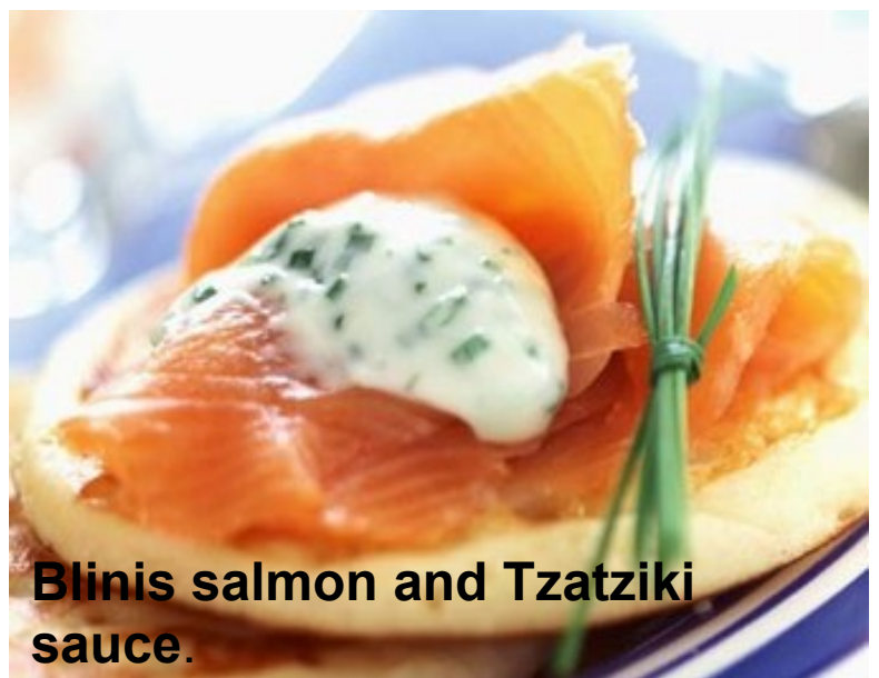
Blinis salmon and Tzatziki sauce.