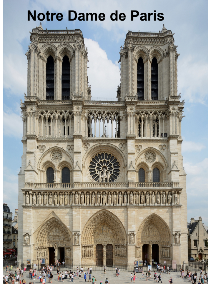
Notre Dame de Paris

A place I love in France is Le Clos Lucé in Amboise, which is the home of Leonardo da Vinci, he lived there for 3 years. He was invited by King Francois 1. The garden is wonderful for walks and exploring his world.