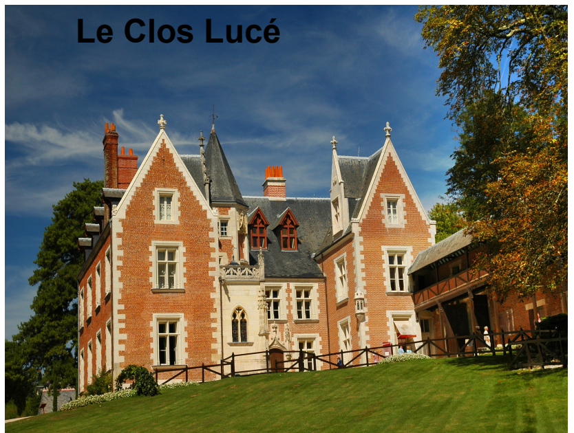
Le Clos Lucé