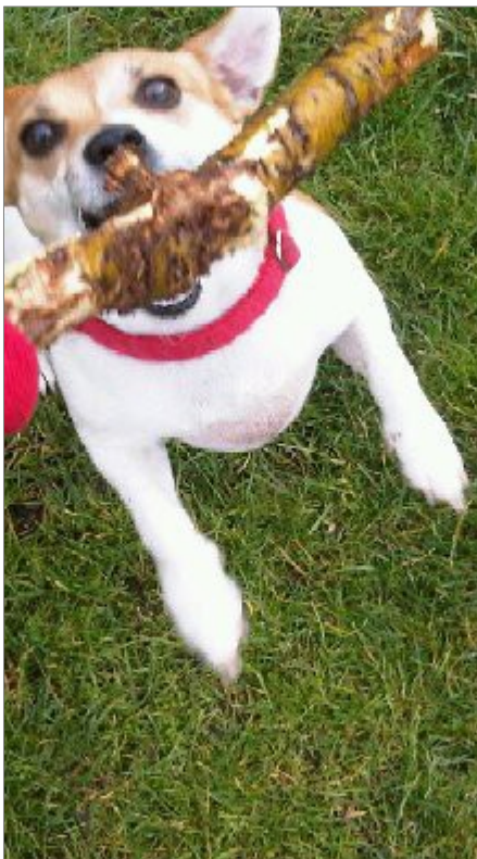
My dog, Reggie!