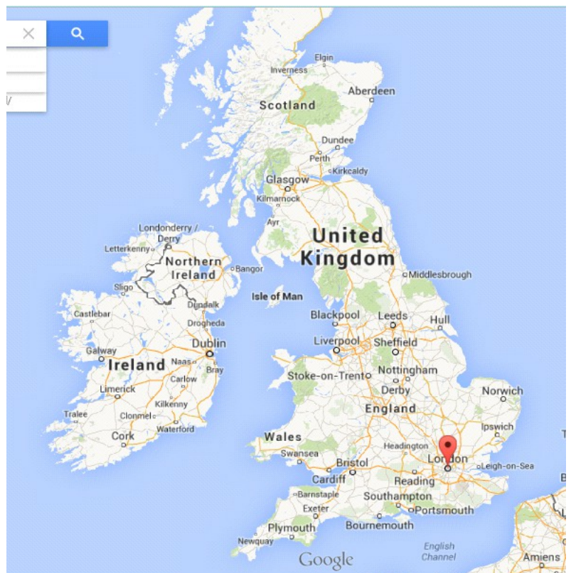
London on a map