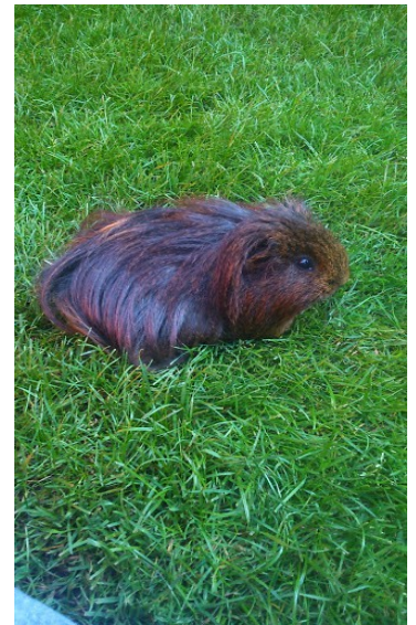
My guinea pig, Mikey!